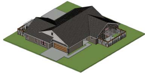
Tri - Home Villa